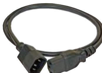
- IEC 60320 Power out