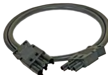
- Wieland Power out